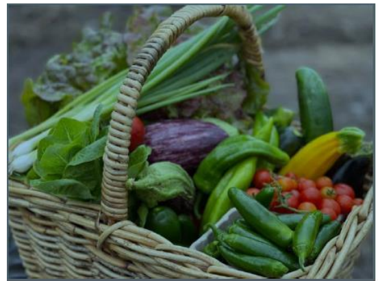
Photo: Produce harvested from Acres and Acres market garden.

The Victorian Government is supporting Acres and Acres through the Climate Ready Hume program. For more, visit Acres and Acres website and check out the video on Facebook